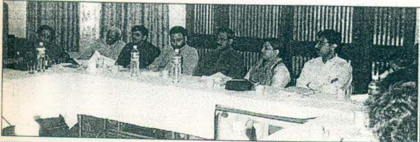
A Partial view of the participants