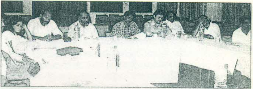
A Partial view of the participants

conduct classes for two hours for child labourers. CACL Maharashtra opposed this demanding full time formal education for all children. They were also documenting cases of domestic girl child labour. Workshops on JJ Act, CRC Conventions and CLPRA were conducted.